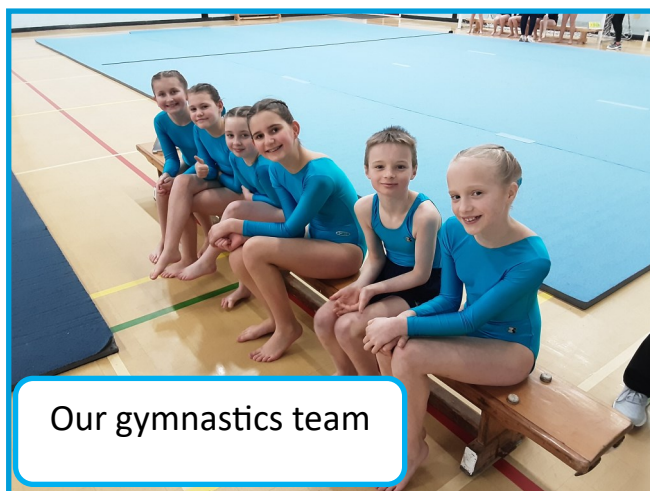
Our gymnastics team