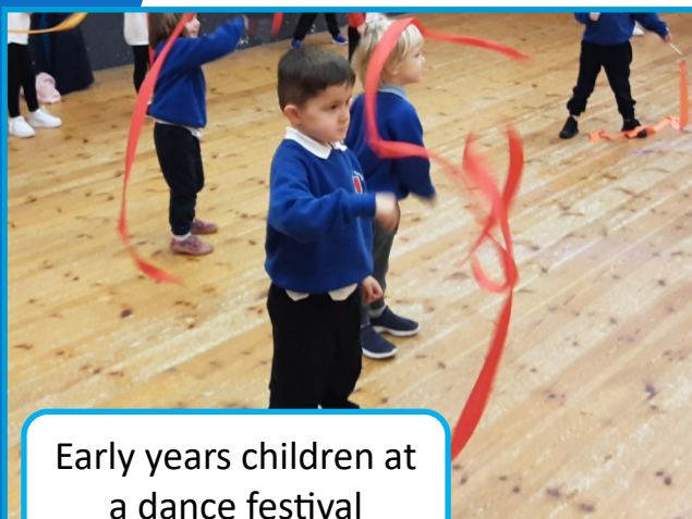
Early years children at a dance festival