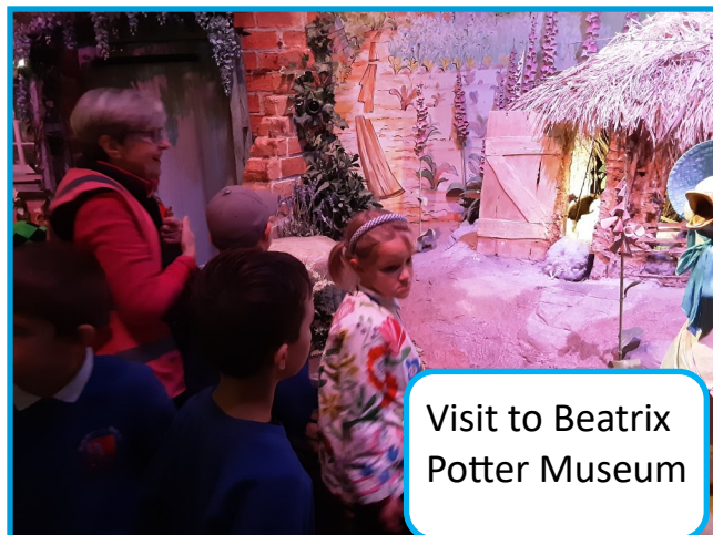
Visit to Beatrix Potter Museum